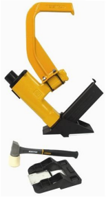
Bostitch MIIIFS – Flooring Stapler w/ 3/4” base plate Solid 3/4” Flooring Application

4350 Peachtree Industrial Blvd. Norcross, GA 30071 Suite 150 Tel: 1-866-519-4317 Fax: 1-866-518-2137