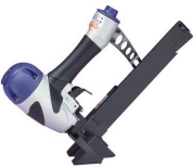
Spotnails WS4840W2 Laminate Hardwood Flooring Stapler Engineered Flooring Application