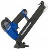
Duo-Fast SureShot 1848-F Hardwood Floor Stapler Engineered Flooring Application