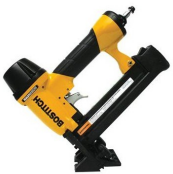
Bostitch SX150-BHF-2 – Flooring Stapler Engineered Flooring Application